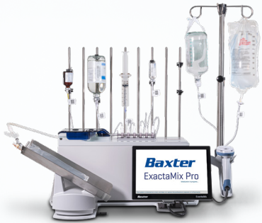
EXACTAMIX PRO AUTOMATED COMPOUNDER