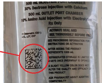
Figure 2: Example of two-dimensional barcode