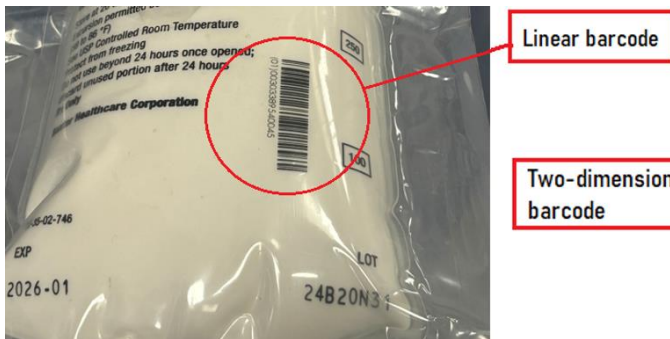
Figure 1: Example of linear barcode which is missing from Clinimix and Clinimix E

To date, there have been no adverse events related to this issue, reported to Baxter.