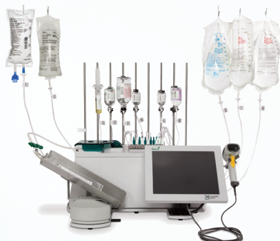
EXACTAMIX AUTOMATED COMPOUNDER